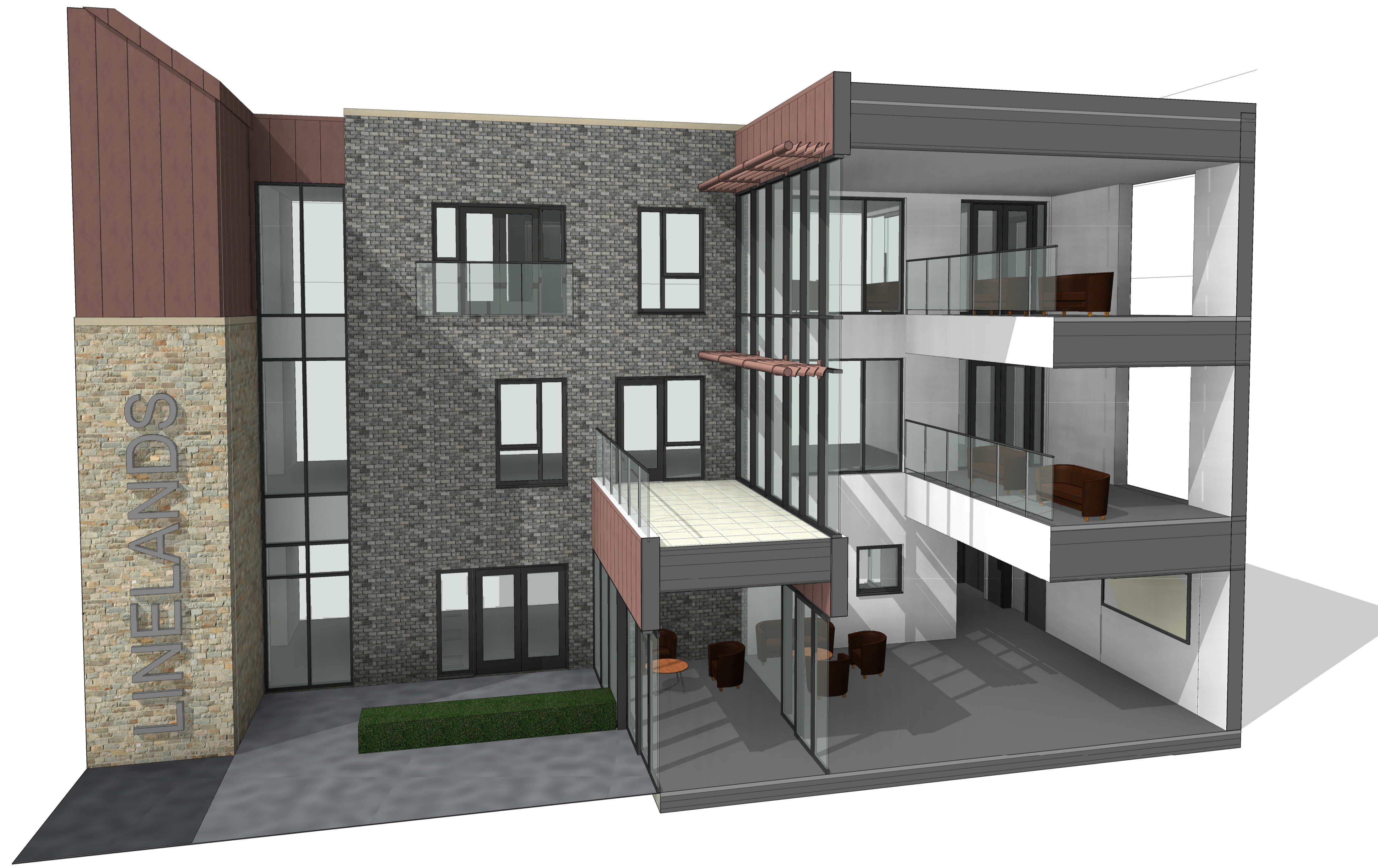
3D - Foyer Section Box